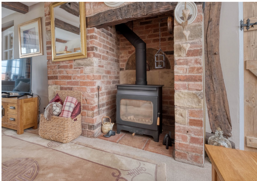
The Cottage, Beoley